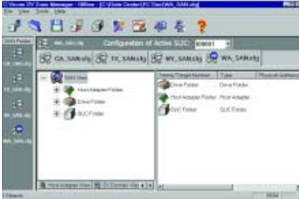
SV Zone Manager GUI screen

SV Zone Manager provides secure, centralized access control for virtualized network storage.